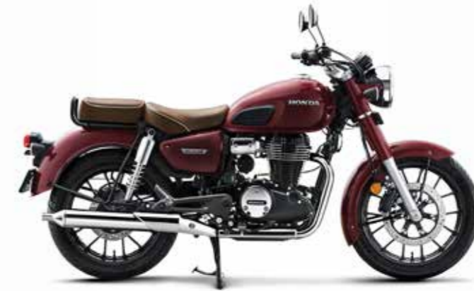
Precious Red Metallic