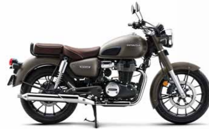
Mat Crust Metallic