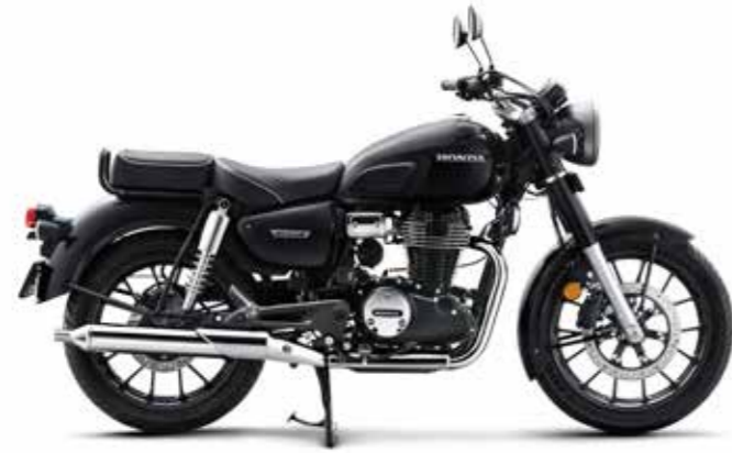
Pearl Igneous Black