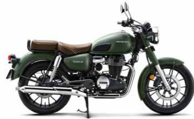
Mat Marshal Green Metallic