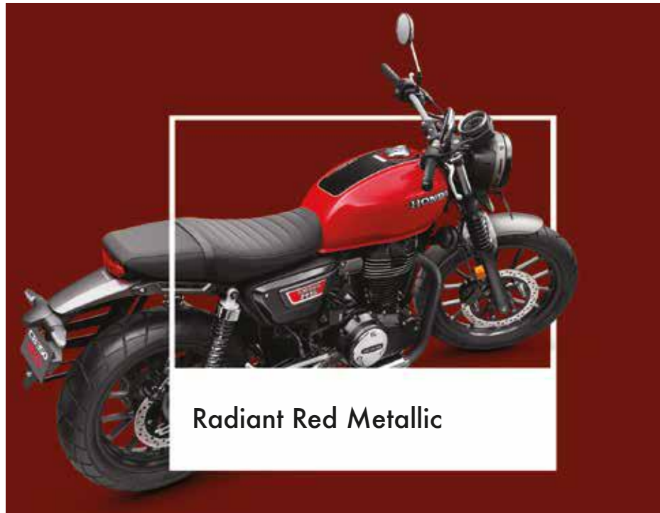
Radiant Red Metallic