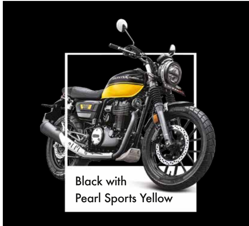
Black with Pearl Sports Yellow