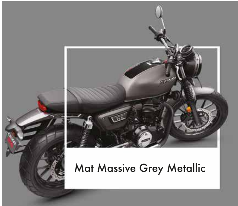
Mat Massive Grey Metallic